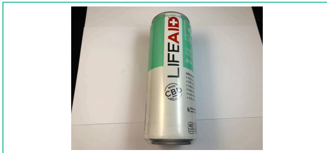
The photo on this report is of a sample collected by the lab and may vary from the final packaging